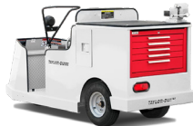
MX-600 The ultimate maintenance cart for indoor and outdoor applications.

Taylor-Dunn's utility vehicles offer practical solutions with optimal performance while reducing your operating and maintenance costs.