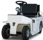
SS-546 Transportation for up to 2 executives, security or other personnel.