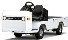
Bigfoot Our flagship burden carrier with big payload and big towing.