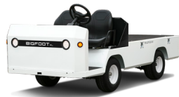
Bigfoot XL Maximum towing for larger operations.