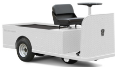
C-432 Narrow aisle utility vehicle for the tightest of spaces.