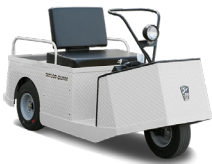
SS-536 Transportation for up to 2 executives, security or other personnel.

Safely transport yourself or a group with a Taylor-Dunn personnel carrier.