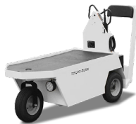
SC-100 24V Carry up to 1,000 pounds and tow up to 5,000 pounds.