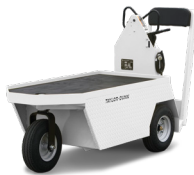
SC-90 Carry up to 900 pounds and tow up to 2,000 pounds.

Taylor-Dunn stockchasers are highly maneuverable, narrow-aisle vehicles that improve warehouse efficiency and productivity.