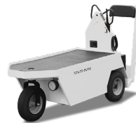
SC-100 36V Carry up to 1,000 pounds and tow up to 5,000 pounds.