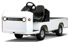
Bigfoot S Compact footprint with tighter turns for smaller facilities.